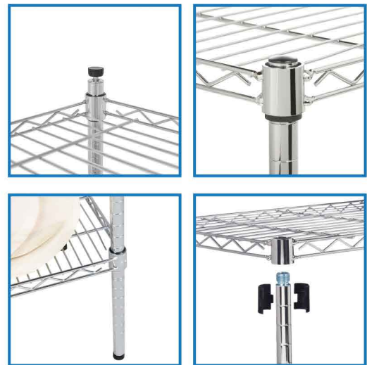
WIRE SHELVING STORAGE RACK - 5 TIER

RACKS ARE AVAILABLE IN STAINLESS STEEL - MS CHROME PLATE - MS EPOXY PAINTED