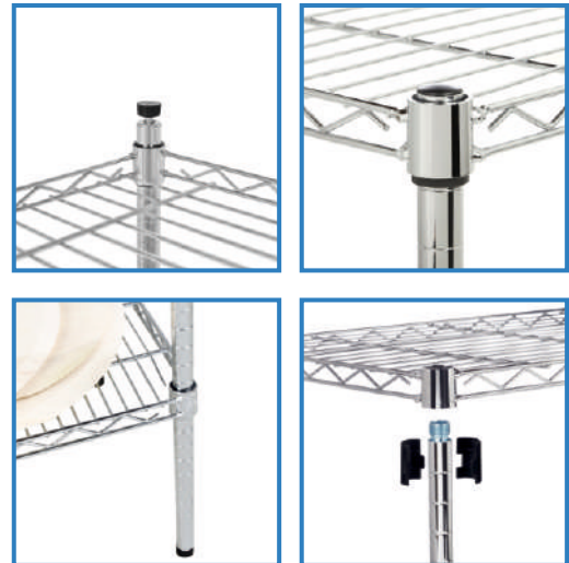
WIRE SHELVING STORAGE RACK - 5 TIER